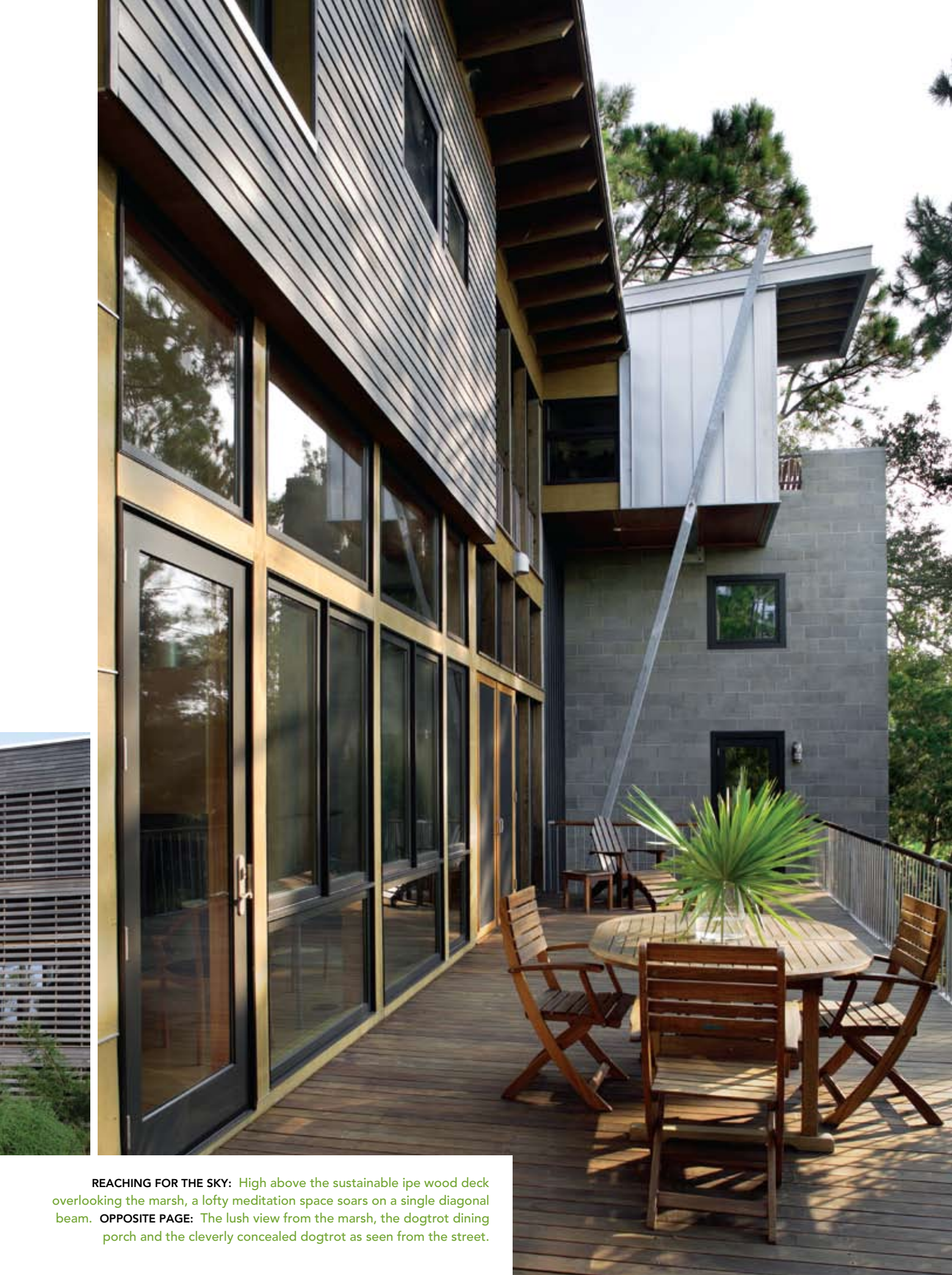
REACHING FOR THE SKY: High above the sustainable ipe wood deck overlooking the marsh, a lofty meditation space soars on a single diagonal beam. OPPOSITE PAGE: The lush view from the marsh, the dogtrot dining porch and the cleverly concealed dogtrot as seen from the street.